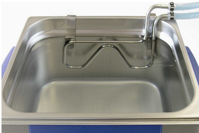
Cooling coil in a deep-drawn ultrasonic tank, connected