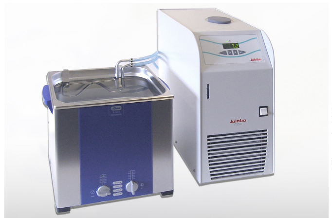
Cooling coil connected to a cryostat (Julabo F250)