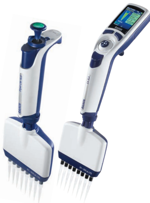
Pipet-Lite XLS+ and E4 XLS+ models

Speed plate work with Rainin's E4 XLS+ electronic multichannel pipettes. Special modes streamline how you transfer multiple aliquots, perform serial dilutions and pre-program series of volume transfers.