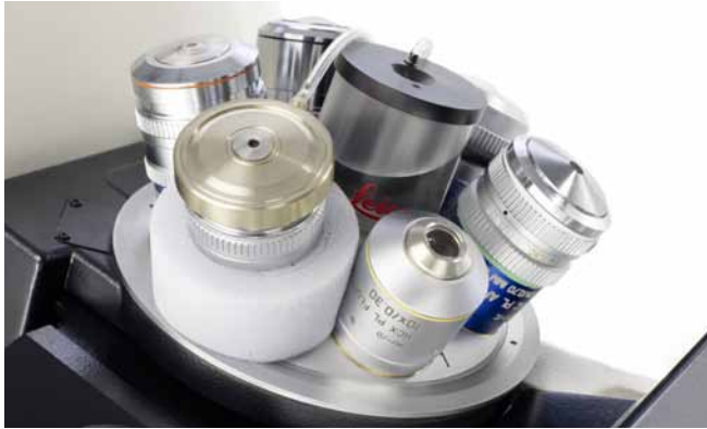
Small and compact design allows utilization of all nosepiece positions. A retrofit to existing Leica DMI6000 B is possible.