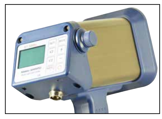
Operation Panel & Flash Adjustment Dial