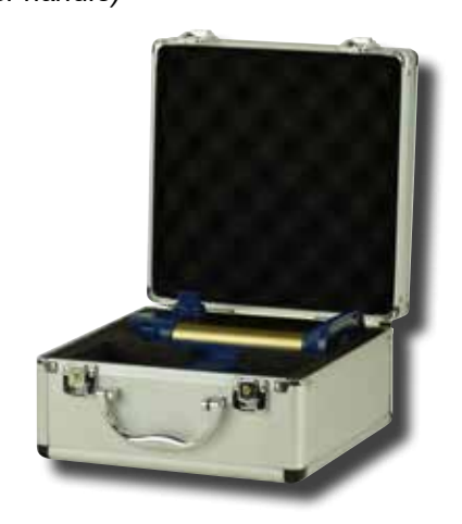
ST-320BL in Included Metal Carrying Case