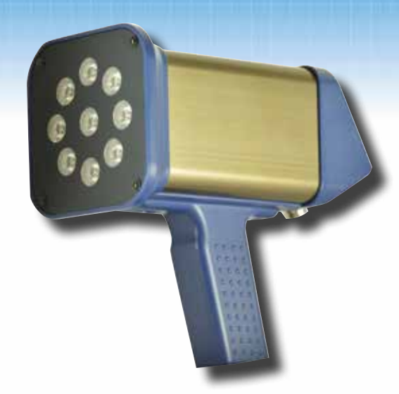
ST-320BL Black Light LED Stroboscope

The ST-320BL is designed for speed and frequency measurements in the printing, packaging, textile, automotive, cable, mining, steel, chemical, optical and medical industries in various applications.