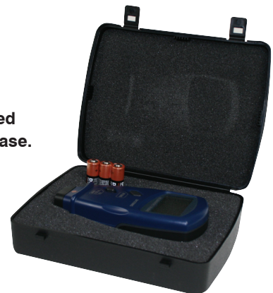
PT-120 with included protective carrying case.