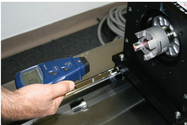
PT-110 recording rotational speed of machinery.