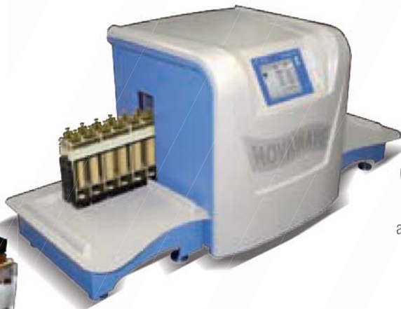
NovaWAVE SA (Catalog No. 010-600-001) A Stand Alone System with all available software and operational parameters.