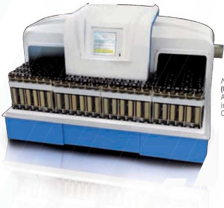
NovaWAVE FA (Catalog No. 010-600-002) A Fully Automated System that includes the Transporter, Auto-Cooling and Auto-Venting Stations.