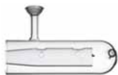
Catalogue No. 020-056-101

Description Quartz spray chamber for Babington Nebulizer Quartz spray chamber for X-flow Nebulizer Quartz ball joint connector Clamps