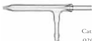
Catalogue No. 020-060-002

Description Babington Nebulizer Pyrex Concentric Nebulizer Quartz Concentric Nebulizer