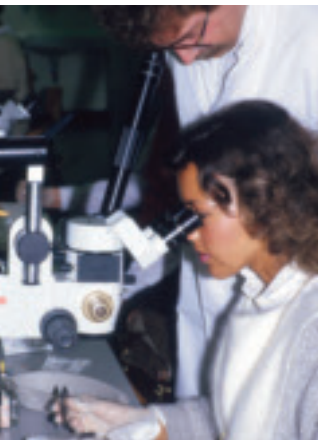
Leica M651 training microscope