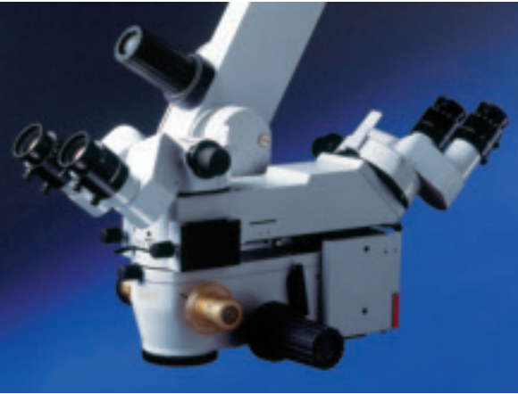
Leica M651 with 180° dual stereo attachment