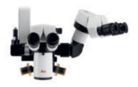
Assistant microscope tube and camera