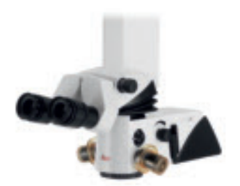
Variable binocular tube

A wide range of observation accessories meets all users' ergonomic requirements, offering the best possible view. The modular system allows a subsequent and straightforward upgrade.