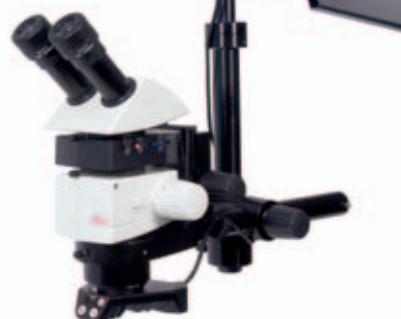
Leica S series with LED1000 HiPower spotlight combi controller and focusing arm.