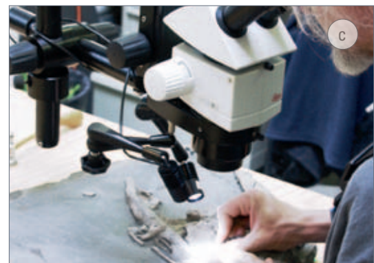
The compact focusing arm is suitable for table and wall.