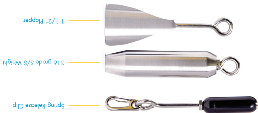
Figure 1 Spring Release System with accessories