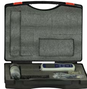
FG-7000T with Included Accessories and Carry Case