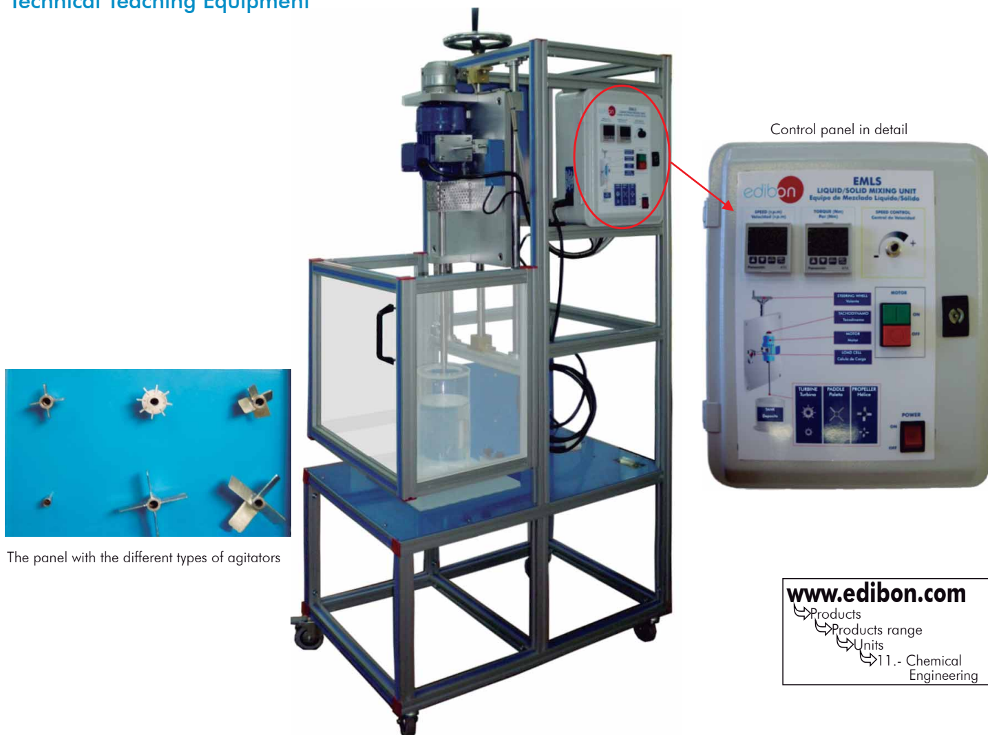
The panel with the different types of agitators