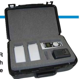
Optional DT-900-PR Professional Kit with Included Case