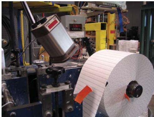
DT-315A Viewing Labeling Machine