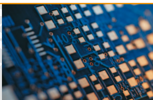
Measurement on PCBs: Au/Ni/Cu/PCB

The XUL and XULM instruments are both equipped with proportional counter tube detectors; however they differ in their X-ray tubes, filters and apertures. The robust and cost-effective XUL is furnished with one aperture and one fixed filter. The standard built-in X-ray tube has a larger primary beam spot; therefore, the smallest useful aperture is 0.3 mm. Because of beam divergence, only measurement spots of about 0.7 mm – 1 mm can be resolved.