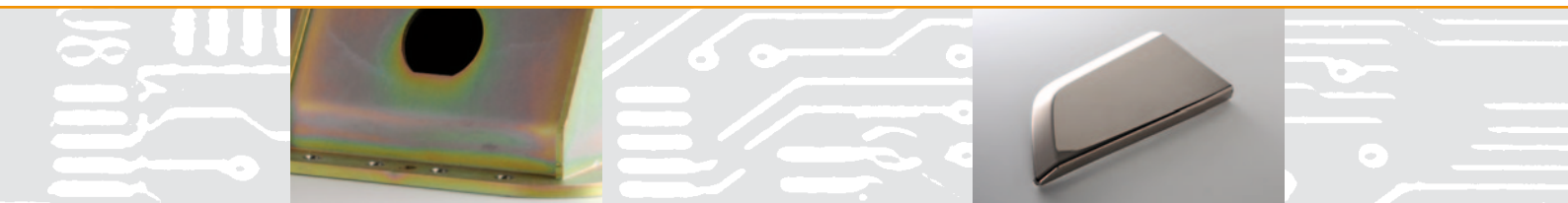
Corrosion protection: Zn/Fe