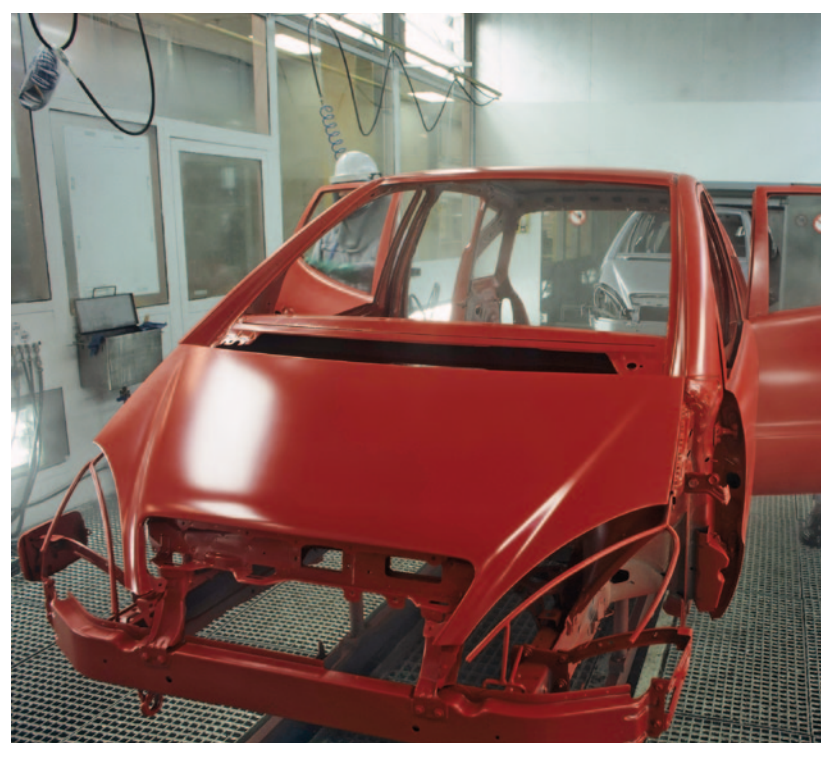
Car body after the painting process