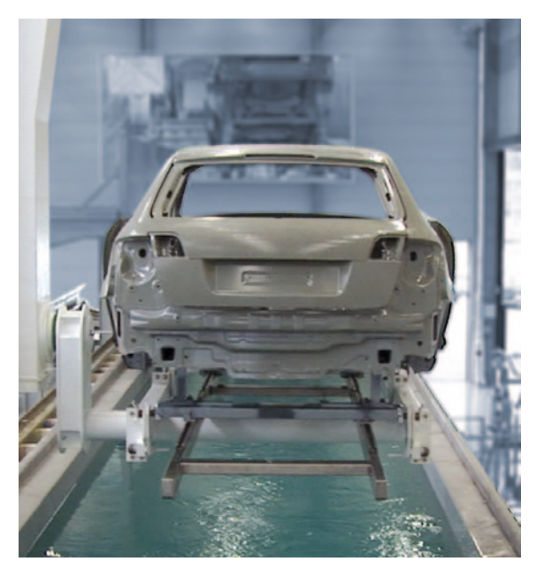
EPD painting process