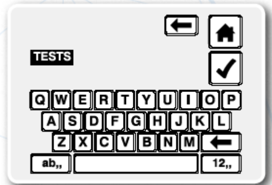
Typical Screen Views

ELE International Chartmoor Road, Chartwell Business Park Leighton Buzzard, Beds, LU7 4WG England Tel: +44 (0) 1525 249 200 Fax: +44 (0) 1525 249249 email: ele@eleint.co.uk http://www.ele.com